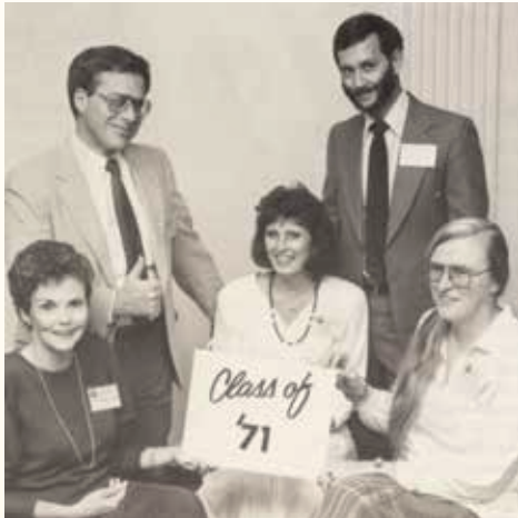
Class of 1971, 15th Reunion