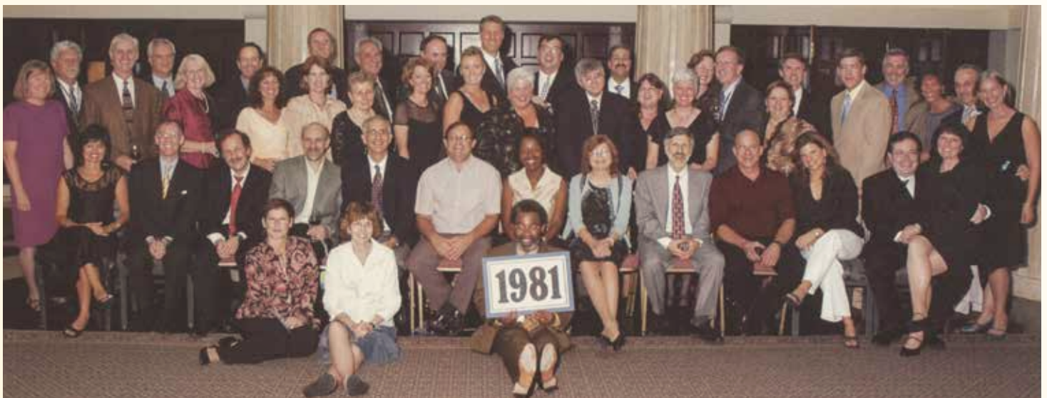
Class of 1981, 25th Reunion