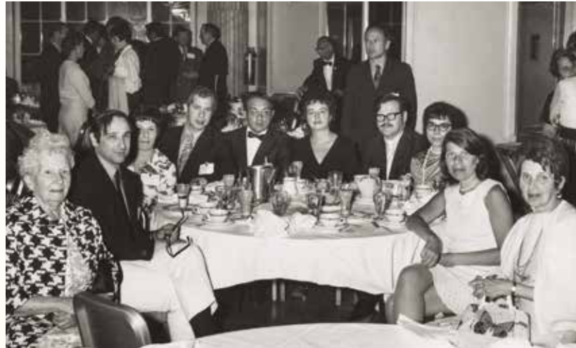
Class of 1956, 15th Reunion