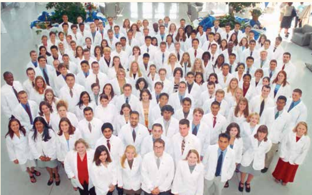
Members of the Class of 2006, White Coat Ceremony

Bank of America Cigna Goldman, Sachs & Co Matching Gift Program Johnson & Johnson Family of Companies