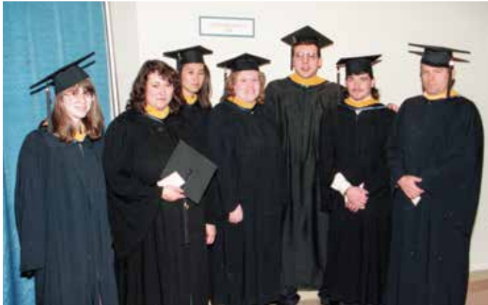
Members of the Class of 1996 at Commencement