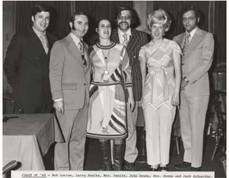
Class of 1966, 5th Reunion