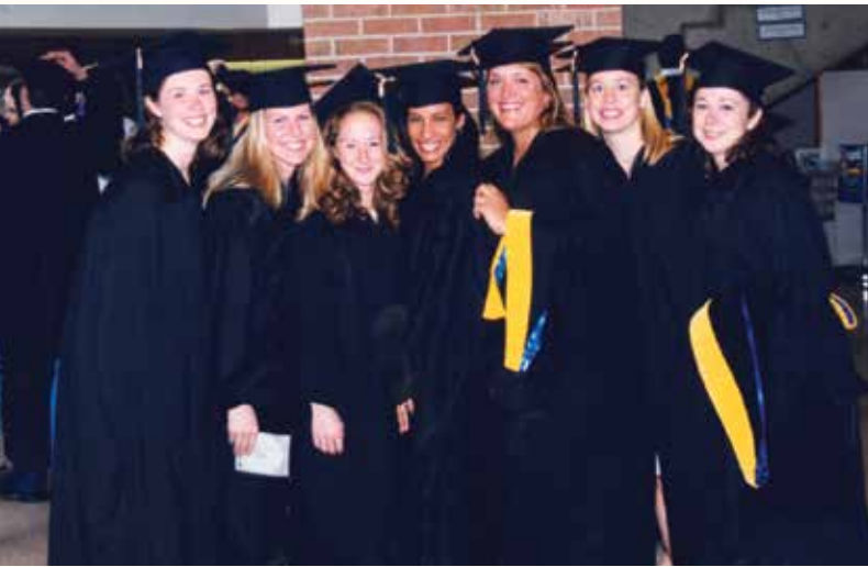
Members of the Class of 2001 at Commencement