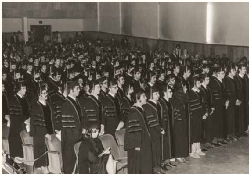
Class of 1976, Commencement