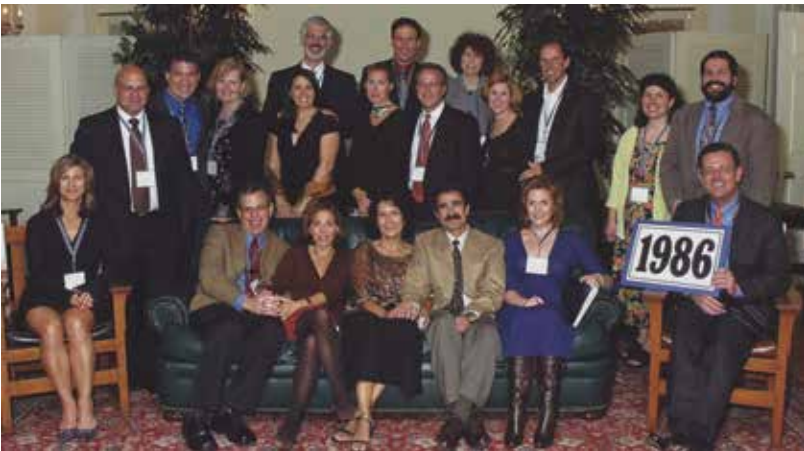
Class of 1986, 20th Reunion